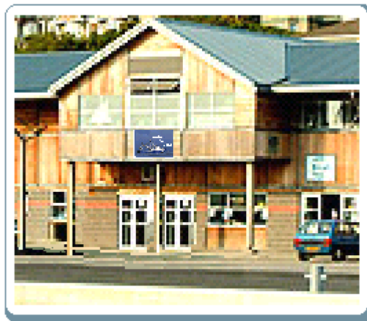
The first Shrimp Boat John restaurant Nashville, Tennessee - 1992